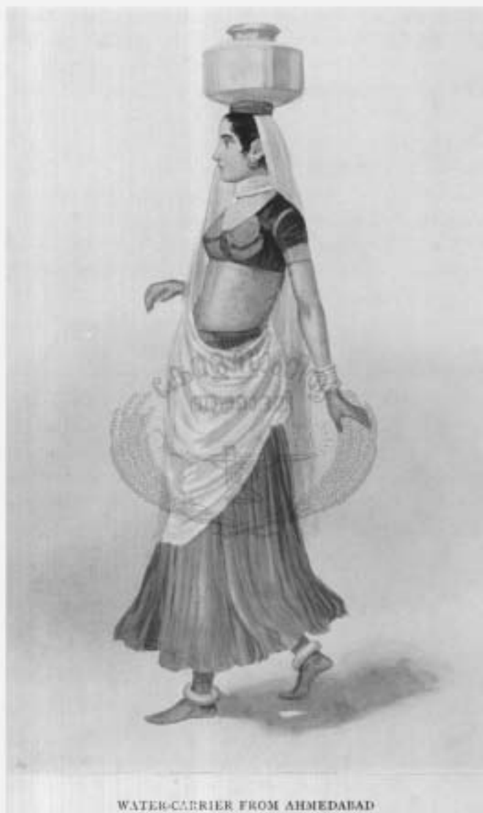
WATER-CARRIER FROM AHMEDABAD